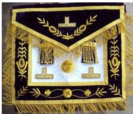
ELECTED GRAND LODGE OFFICER / MWPGM APRON WITH APPROPRIATE JEWEL OF OFFICE (Purple with Gold Embroidery)