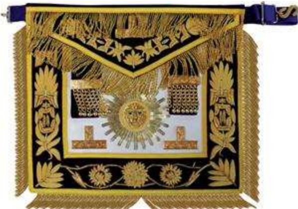
GRAND MASTER (Purple with Gold Embroidery)