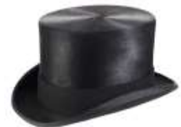
Top Hat (Formal Affairs Only)