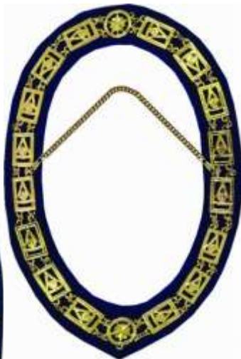
PASTER MASTER COLLAR (Gold or Silver Chain / Blue Backing, No other Trimmings or ornaments may be attached excepted the Jewel)