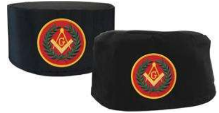
Blue Lodge Crowns