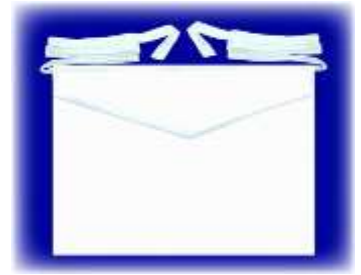
(Funeral / Memorial Apron)

SUBORDINATE LODGE APRONS WITH JEWEL OF OFFICE ARE AN OPTION THE MASTER MASON APRON ABOVE IS ACCEPTABLE FOR ALL MASTER MASONS