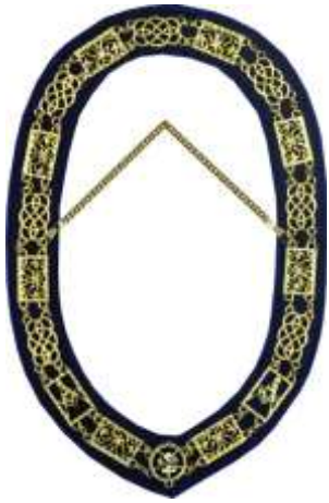
STANDARD GRAND LODGE OFFICER COLLAR ( Purple Backing Gold chain with Grand Emblems) No other Trimmings or Ornaments may be attached - APPOINTED GRAND LODGE OFFICERS