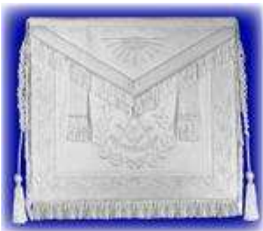
STANDARD GRAND LODGE APRON – FUNERALS/MEMORIAL SERVICES