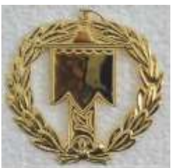
GRAND STANDARD BEARER