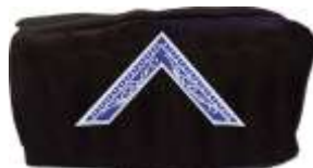
Master's (Brimless) Cap