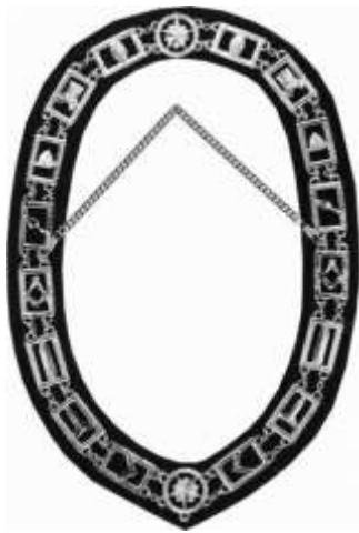
STANDARD SUBORDINATE LODGE COLLAR LOCAL LODGE OFFICERS (Silver Chain / Blue Backing. No other Trimmings or ornaments may be attached excepted the Jewel)