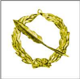
ASSISTANT GRAND SECRETARY