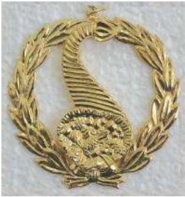
SENIOR GRAND STEWARD