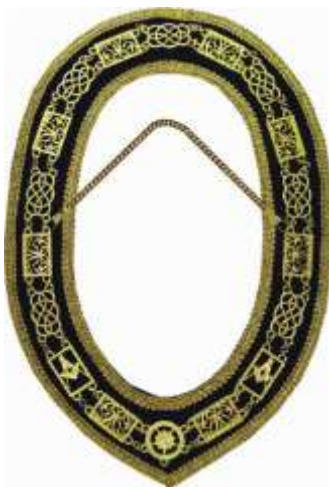
ELECTED GRAND LODGE OFFICER COLLAR (Gold Braid / Purple Backing)