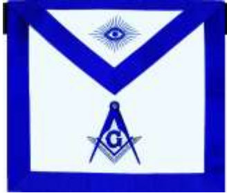
(MM Dress Apron)

Lamb Skin or Cloth. A Fringe of Blue, Silver or White may be added. NO WREATH ON THE JEWELS, NO TABS, NO ORNAMENTAL LILLY WORK, NO TAUS, NO METAL CHAIN TABS