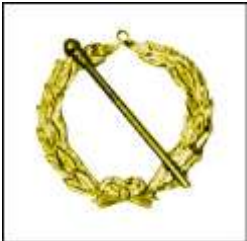
ASSISTANT GRAND MARSHAL