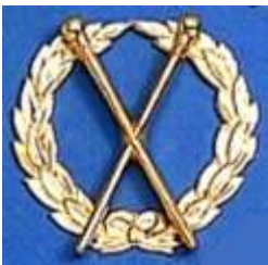
GRAND MASTER OF CEREMONIES