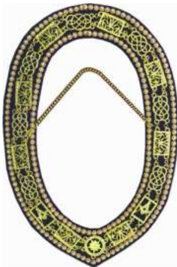
GRAND MASTER / DEPUTY GRAND MASTER / PAST GRAND MASTER COLLAR (Inner/Outer Rhinestone Beaded - Purple Backing)