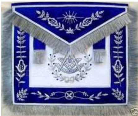
PAST MASTER APRON Blue with Silver Embroidery NO WREATH