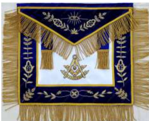
PAST MASTER APRON (Blue with Gold Embroidery NO WREATH )