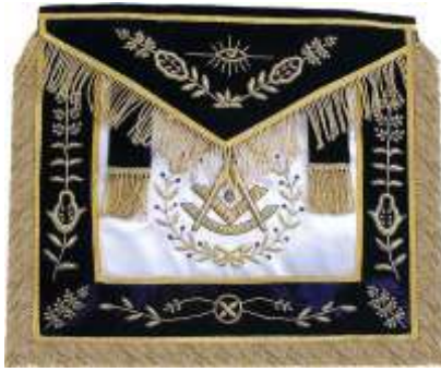
STANDARD APPOINTED GRAND LODGE OFFICER APRON (Purple with Gold Embroidery) No Tau or metal link tabs