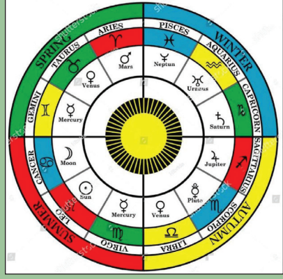
Astronomy And The Craft: A View (See Page 22)