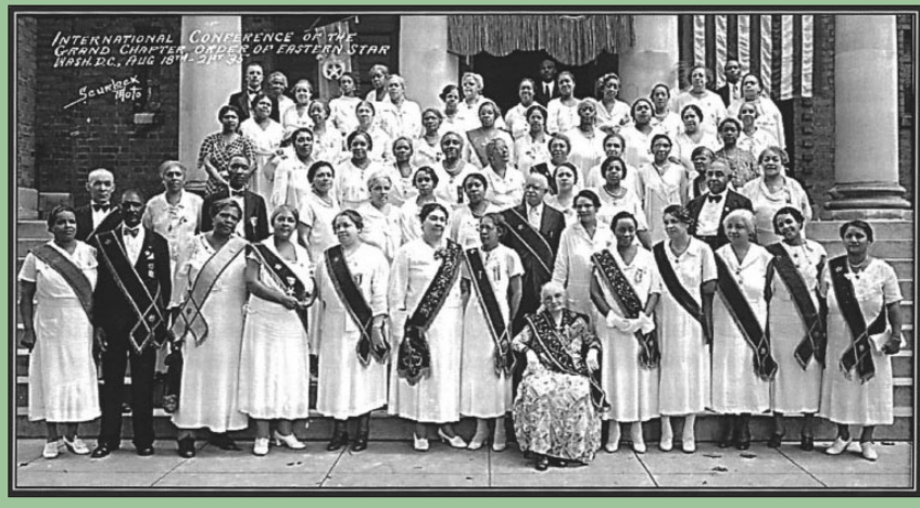
Untold: The Truth About The Order Of Eastern Star Prince Hall Affiliation (See Page 13)